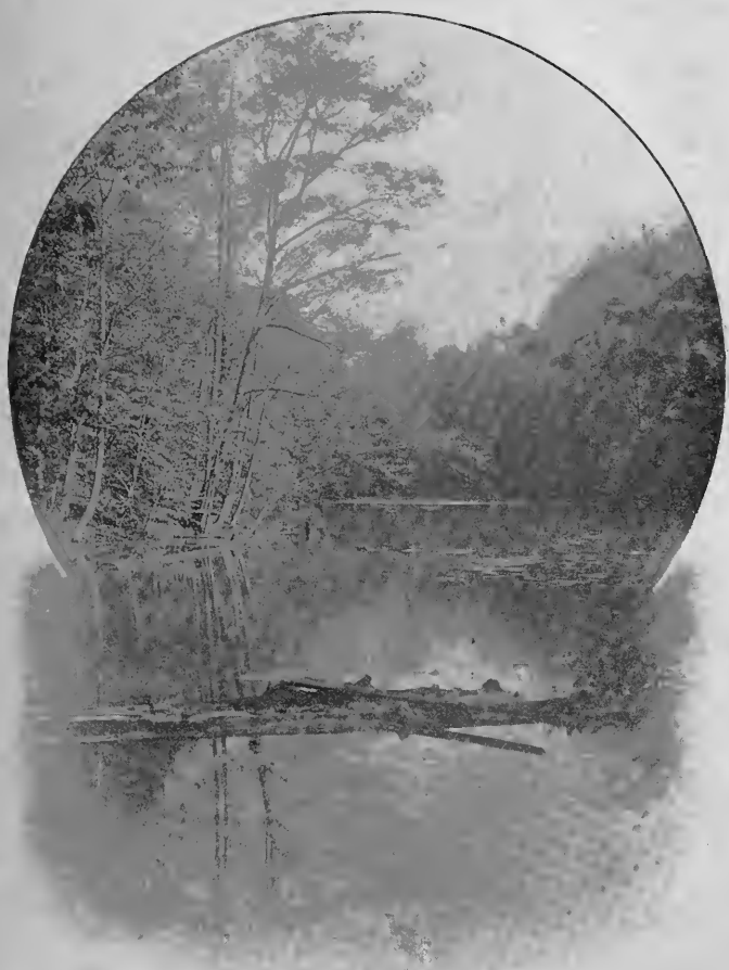
The Ol' Fishin' Hole